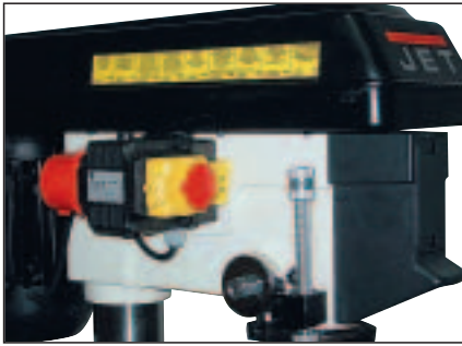
Left/right-handed rotation on 400-volt JDP-15 and JPD-17 F models

Hinged steel belt and pulley cover for easy access