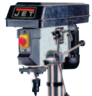
Quick clamping precision chuck

Hinged steel belt and pulley cover for easy access